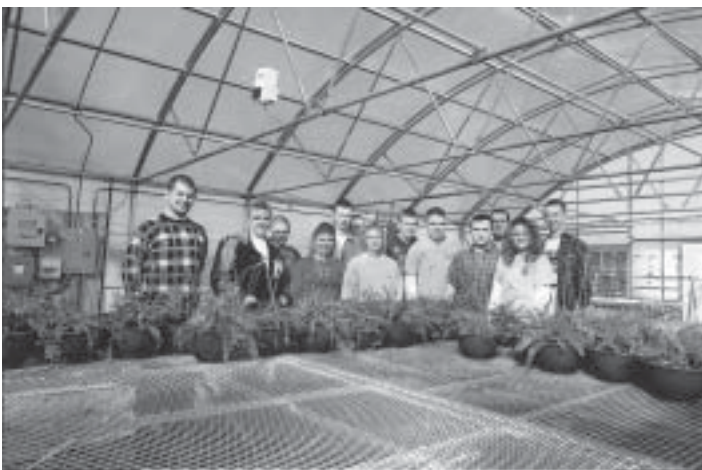
Above, high school students in a Monroe County educational greenhouse funded by the Agricultural Development Board

Our staff considers it an honor to be involved in this historic initiative to redesign Kentucky's agricultural economy. We look forward to the challenges that lie ahead.