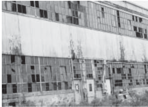
Above, an old, abandoned airline hanger became home for a week to a group of volunteers in New York City.

During our week-long stay, our group worked alongside other groups of volunteers – who had traveled from both