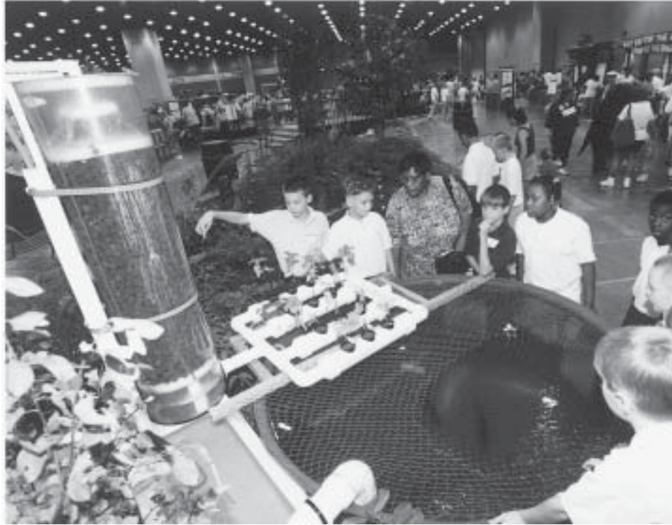
School groups from across the Commonwealth visited the 2001: A Water Odyssey exhibit during the 2001 Kentucky State Fair.