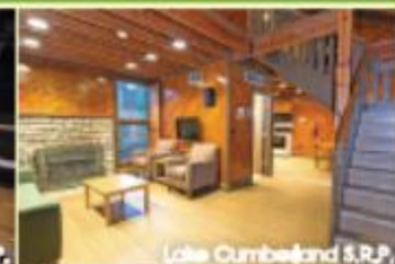
Lake Cumberland S.R.P.

Make your reservations on-line at parks.ky.gov and use the promo code "TRCC". Individual park numbers can be found on-line, or call 502-564-2172 to ask for park numbers. Be sure to mention the "Commonwealth Connection" to receive your special rate when making your reservation by phone!