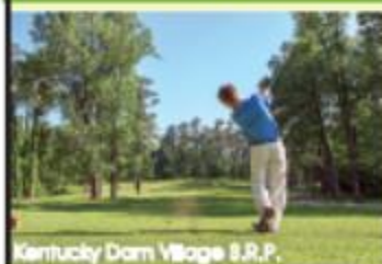
Kentucky Dam Village S.R.P.

A 10% discount applies the rest of the year to active state employees only. One accommodation at discounted rate per state employee per visit. Leisure travel only; does not apply to campgrounds.