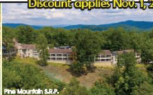
Pine Mountain S.R.P.