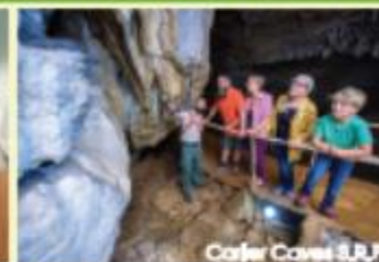
Coker Cove S.R.P.